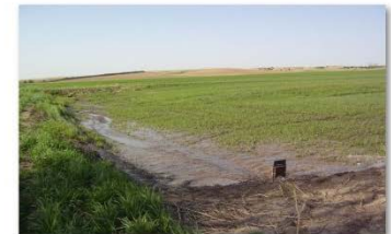
Collection of overflow.