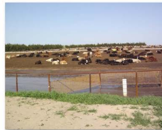
Runoff from feedlot pens is collected in one of four sediment basins and piped to a pump station by gravity.