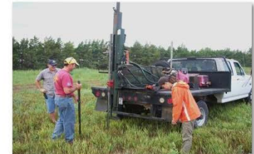
Soil and runoff samples were analyzed for nutrients and microbes.