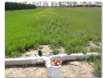
Only one treatment area is used at a time.