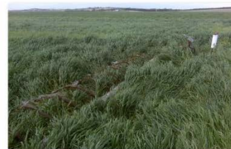
Application of runoff to field.