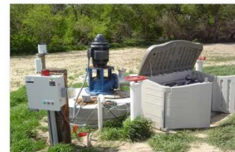
Pump Station: Flow onto vegetative area and return flow is measured.